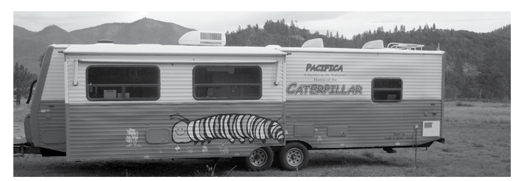
Pacifica's mobile science and nature center needs a new Caterpillar!

The Caterpillar's educational programs have been presented to thousands of schoolchildren in Josephine and Jackson counties over the past 16 years, drawing rave reviews from teachers and students alike.