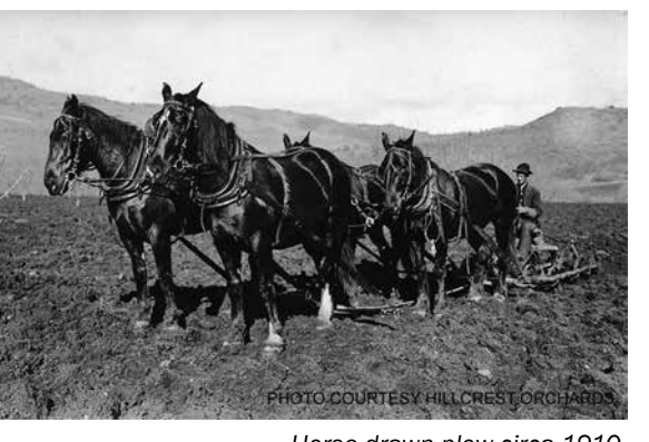
Horse-drawn plow circa 1910.

UNSUNG HEROES feel the Applegater helps fill a big piece of this void, and