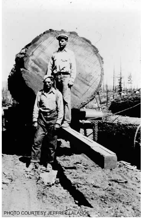
Logging near Butte Falls circa 1940.