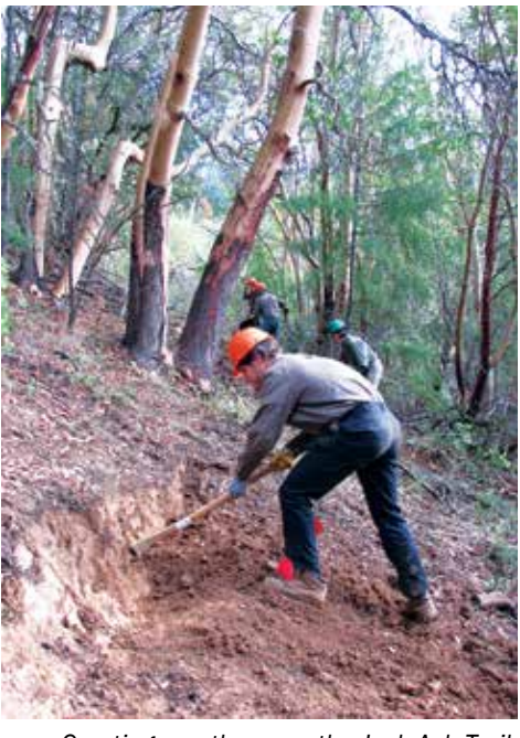
Creating a pathway on the Jack-Ash Trail.

and Recreation as southern Oregon's first Scenic Trail. The first trail-work party was held on February 18; future work parties will take place on Saturday, March 18, and Saturday, April 22, from 8:30 am to 1:30 pm. SUTA serves midmorning snacks and lunch. For details, see sutaoregon.org.