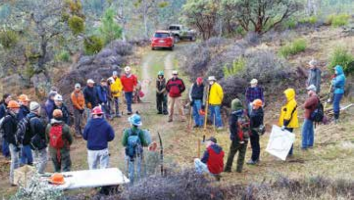
SUTA's first trail work party in November 2016.