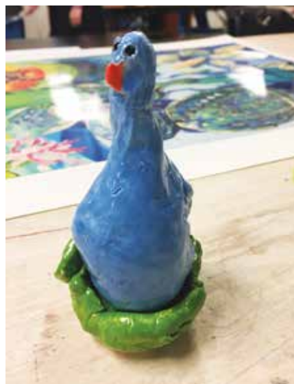
Ceramic art piece created by first-grade student.

who live in the greater Applegate area. The school's PTO manages funds from an annual auction that supports unique and needed programs, including the visual and performing arts at Ruch School.