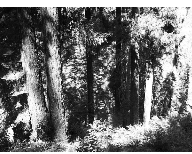
Siskiyou National Forest.