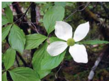
Western dogwood ( Cornus nuttallii ).

another three-needled pine. Other unusual species growing on