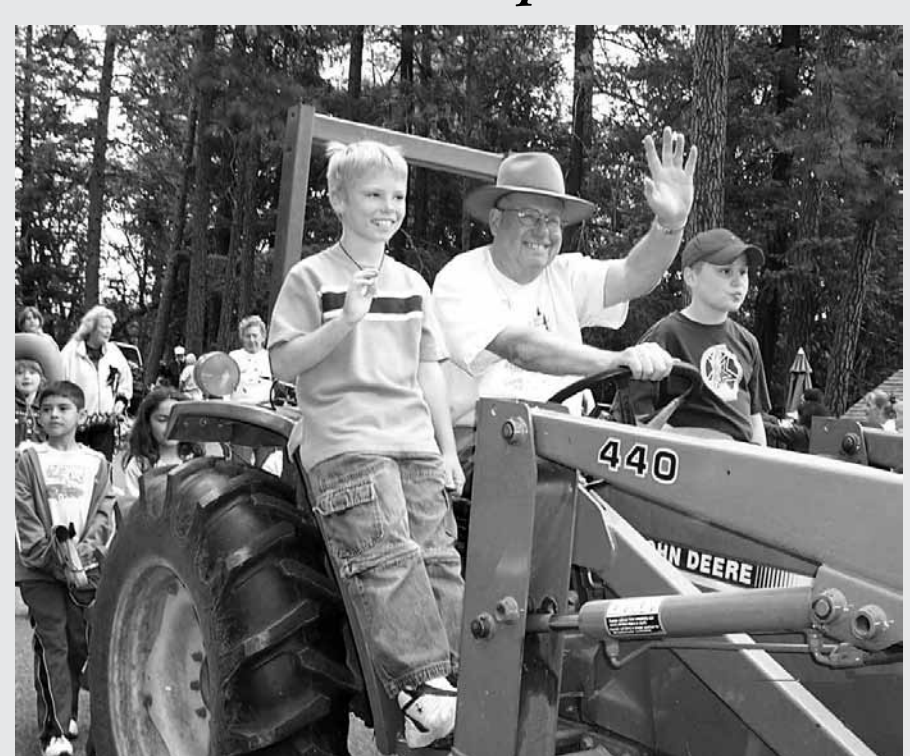
Buncom by leading the 2004 Buncom Day Parade. Hooray for the Mayor!