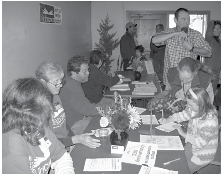
Signing up for library cards.