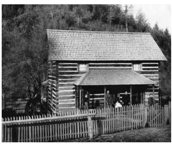
Photo above: Eagle Hotel. Photos below, left to right: Eagle Hotel, barn, Saltmarsh log house