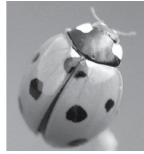
Nonnative species Harmonia axyridis, top photo, and C-7, bottom photo.

that you find along with information about the location where you found them, and assistance is provided to identify the species. This is a good example of "citizen science" with the public contributing information that a single researcher cannot readily obtain, such as how ladybug populations are changing across the continent.