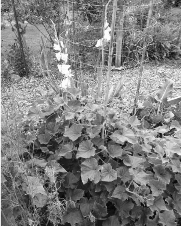
Several varieties of cucumbers grow in a raised bed with dill and volunteer gladiolas.

the garden, for example, peas put nitrogen back into the soil so a green leafy vegetable such as kale can grow tall and healthy if planted in the same soil after the peas are harvested. Another great practice is to plant a cover crop such as clover or legumes. Digging or plowing under the finished crop will then replace and