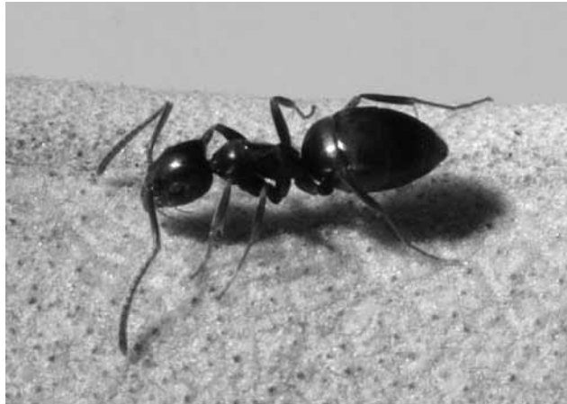
Top photo: Carpenter ants are the largest ants found locally. Bottom photo: Odorous house ants often invade kitchens.

their favored nesting sites. Velvety tree ants, as the name suggests, are most often nesting in a tree hole. While you might think it would be simple to track the ants back to their nest, I have rarely found it to be easy.