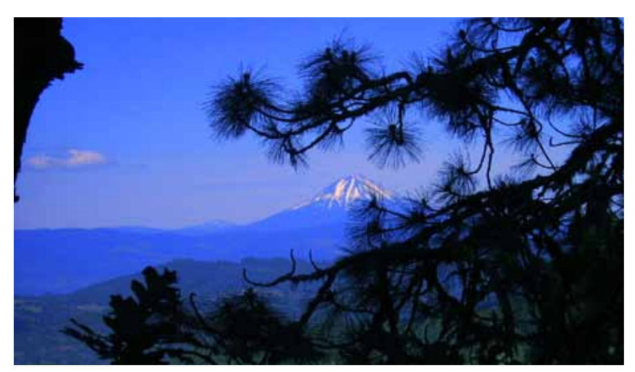
Mt. McLoughlin from Tin Cup Trail

Janeen Sathre 541-899-1443 djsathre@gmail.com