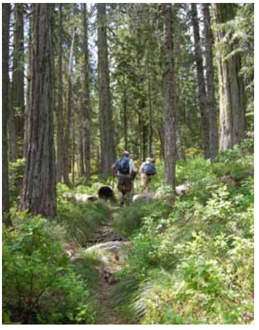
Hiking the Frog Pond Trail