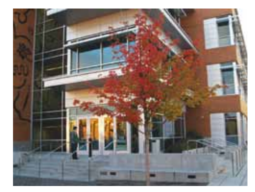
Rogue Community College/Southern Oregon University Higher Education Center, Medford.

Winter Dreams/Summer Gardens Symposium sponsored by the Jackson County Master Gardeners Association. Now in its 15<sup>th</sup> season, this daylong event brings the region's leading authorities together for a lively exploration of topics and issues that challenge gardeners throughout southern Oregon.