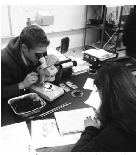
Students examine microorganisms in a sample of compost.

The partnership evolved because of the school's commitment to provide their students with opportunities in place-based education. This approach forges strong ties between local, social and environmental organizations incorporating several goals, among them: helping to improve quality of life and economic vitality, emphasizing learning through participation while integrating core curriculum areas such as math, science and language arts. And the bonus: This approach has proven to re-energize teachers!