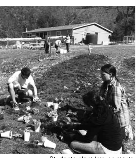
Students plant lettuce starts.