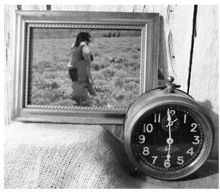
Sioux Rogers and her then six-year-old son Weston, who is now 43 and still one of Sioux's best friends.

Some of the plants in my garden are like my friends—they take me as I am and wait until I have time to weed out the "dead leaves" to catch up and go on from