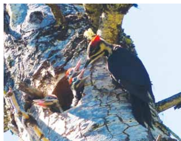
A Pileated Woodpecker pair stays together on its territory all year-round and is a nonmigratory species.