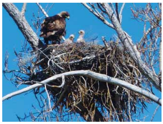
The Golden Eagle uses its agility and speed combined with powerful feet and massive, sharp talons to snatch up its prev.