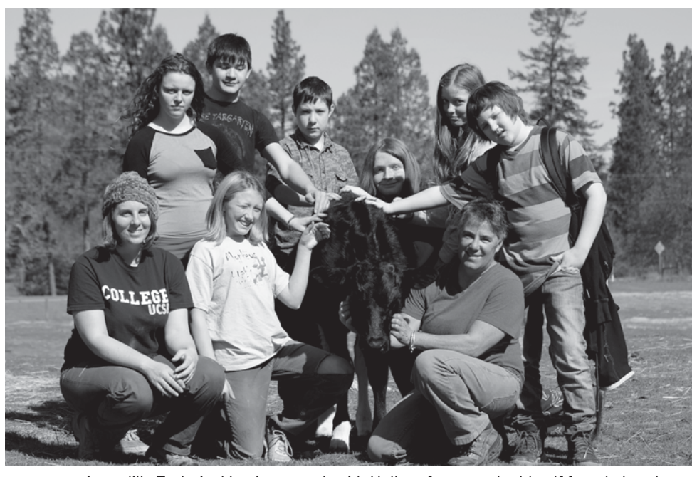
Armadillo Technical Institute youth with Holly, a four-month-old calf found abandoned in the trunk of a car and now thriving at Sanctuary One.

and Alicia Theophil FIV Cat Cottage at Sanctuary One formally opened on Friday, April 24, with over 40 people attending, including the Driscoll family and many animal welfare advocates and leaders. The new Cat Cottage addition is complete with indoor and outdoor access, an intake/isolation area, chairs for visitors.