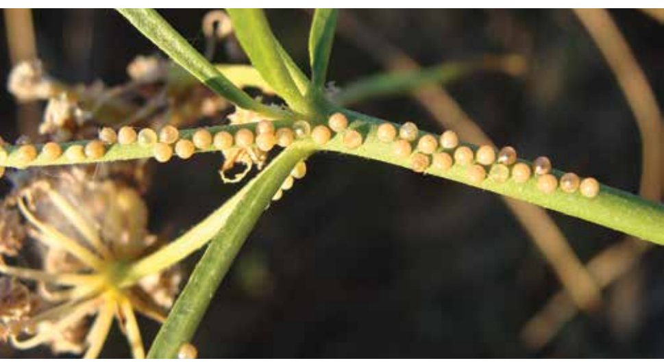
Clio Tiger Moth eggs on narrowleaf milkweed.

Kristi Mergenthaler, with Southern Oregon Land Conservancy, describes the "magical" RPP: Rogue River Preserve is a 352-acre property located north of Eagle Point that features two miles of riverfront, an amazing and diverse floodplain property with forests, oak woodlands, meadows, and vernal pools. It supports 29 species of plants and animals that are rare and declining, such as coho salmon (spawning and rearing habitat), wood duck, common king snake, and large-flowered meadow-foam. Southern Oregon Land Conservancy, a local land trust that works cooperatively with people to preserve land, is in the process of raising funds to buy this wild valley-floor property for long-term conservation. For more information or to make a donation, visit landconserve. org/heart of the rogue.