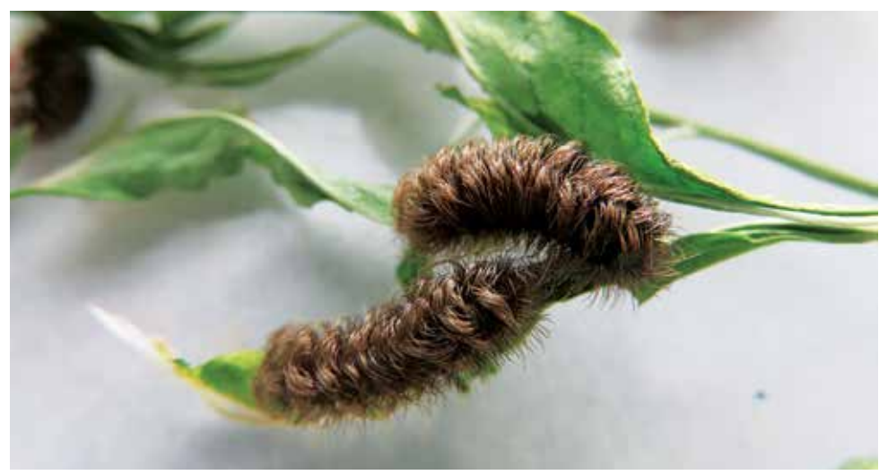
Clio Tiger Moth caterpillars reared from eggs found at RRP.