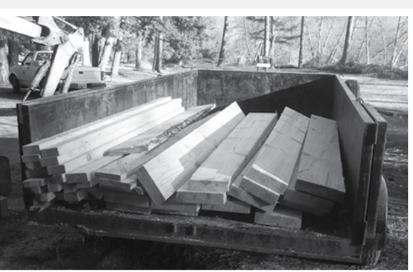
Top photo: Chuck Dahl on his way to the top of a huge ponderosa pine. Bottom photo: Wood from the pine tree is being milled to make new picnic tables.