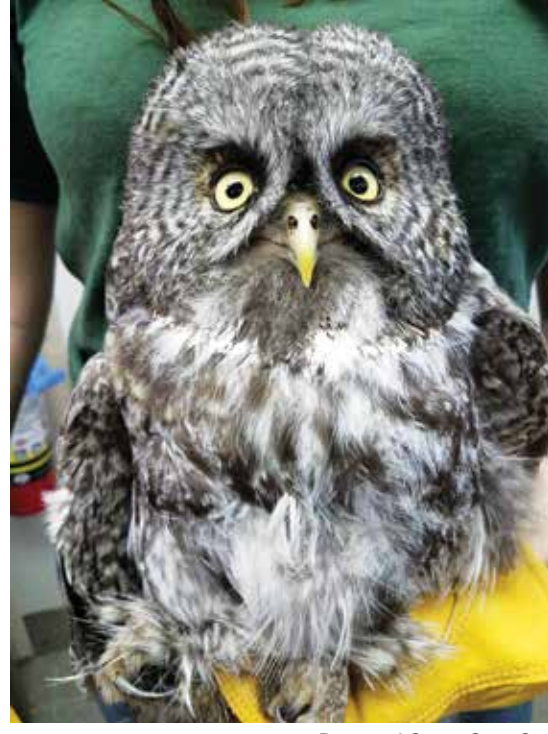
Rescued Great Gray Owl

This is a story of a successful owl rescue and rehabilitation at Wildlife Images in Grants Pass.