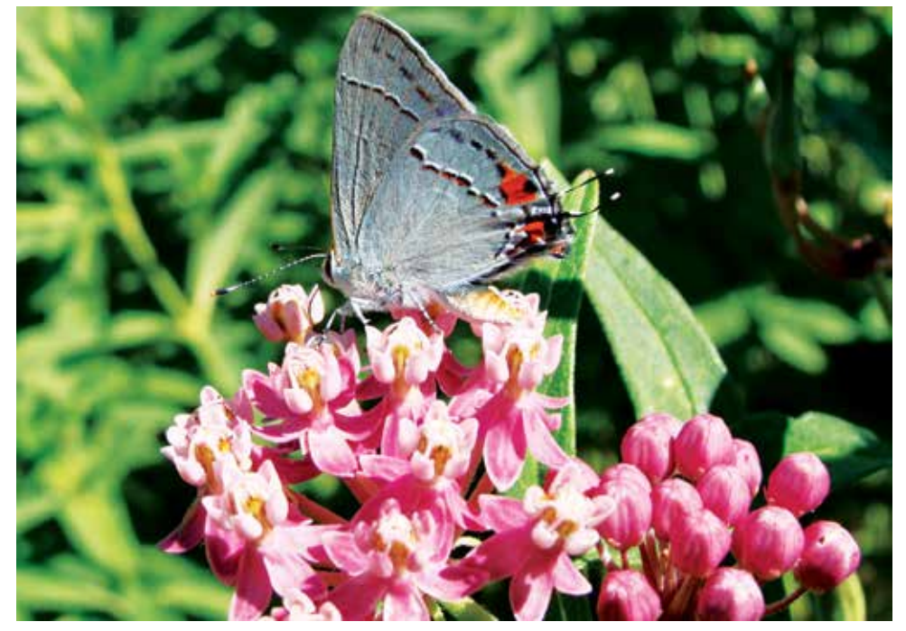
Gray Hairstreak butterfly on swamp milkweed at Applegate School.

Nectar sources are many: flowers of alfalfa, spreading dogbane, rabbitbrush, mint, purple loosestrife, goldenrod, buckwheat, and just about any bloom in the vicinity of their flight. I have seen the Gray Hairstreak on islands of poison oak at the Ashland Imperatrice Hills to the banks pattern and rapid flight, speeding from one of the Rogue River near Galice, where they feast on a variety of riverbank blooms, most often narrowleaf milkweed. One can get a close look as the Gray Hairstreaks nectar in the sun, rubbing their tails back and forth. Fun fact