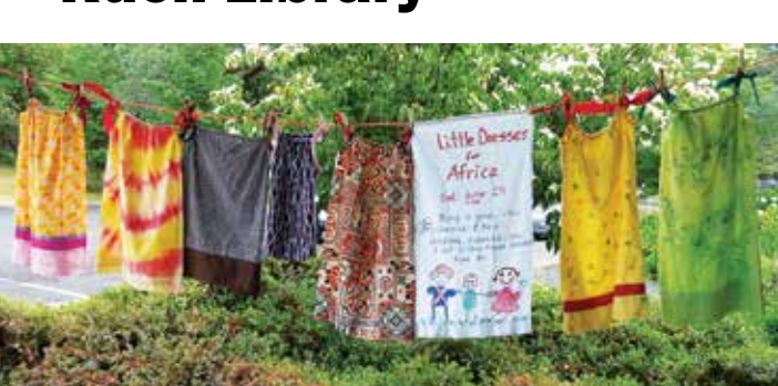
Dresses created out of pillow cases at Ruch Library to send to girls in Malawi, Africa.

The Stories of Southern Oregon project organized community forums last spring, archiving local stories and photos for Southern Oregon University's Hannon Library Digital Collection. Join the storytellers for a reception at Ruch Library on Saturday, May 5, from 2 - 4 pm to hear some of the stories and view the videos. For more information about the project, see the article on page 3.