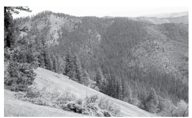
A view across Long Gulch from Wellington Butte in the Wellington Wildlands and the planning area for the Middle Applegate Timber Sale.

For example, the BLM has proposed large timber sales extending from Wilderville to Ruch across the Applegate Valley. The Grants Pass Resource Area has proposed the Savage Murphy Timber Sale, which would log hundreds of acres outside Wilderville, Murphy, and above North Applegate Road. The BLM has proposed to log a fire-adapted forest dominated by large, old trees directly adjacent to the proposed Applegate Ridge Trail (ART). The BLM is also proposing to construct two new roads directly on top of the proposed ART corridor, significantly impacting the trail's scenic character. The ART is being developed by Applegate Trails Association and would connect Jacksonville to Grants Pass through BLM land. The trail could be a significant asset to our community and our economy, but the corridor must be protected from roadbuilding and inappropriate logging. The Ashland Resource Area has also recently proposed the Middle Applegate Timber Sale. The BLM has identified a large planning area sprawling across the Middle Applegate Valley from the mountains around Ruch to Thompson Creek, Humbug Creek, Slagle Creek, and portions of North Applegate. Although it