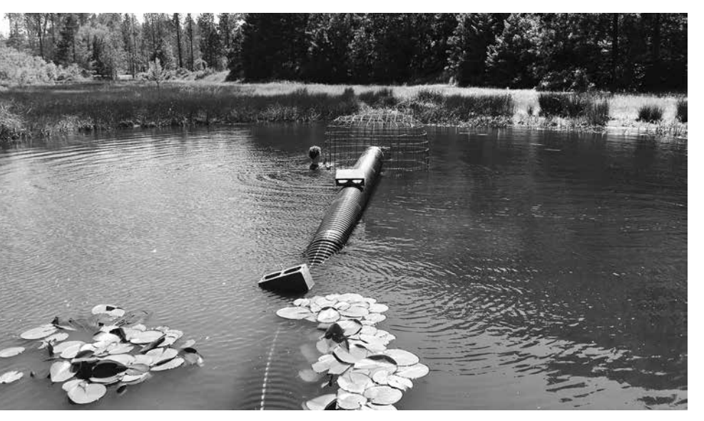
Jakob Shockey situates the cage before untying the float tube during a pond leveler installation.

1. A pond leveler prevents things like flooded basements. It keeps the water passing through the dam at the desired height for pond level, secretly drawing water from the center of the beaver pond